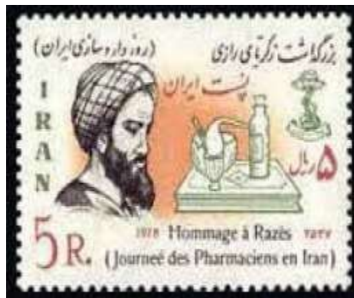
A Persian stamp with Rhazi's portrait